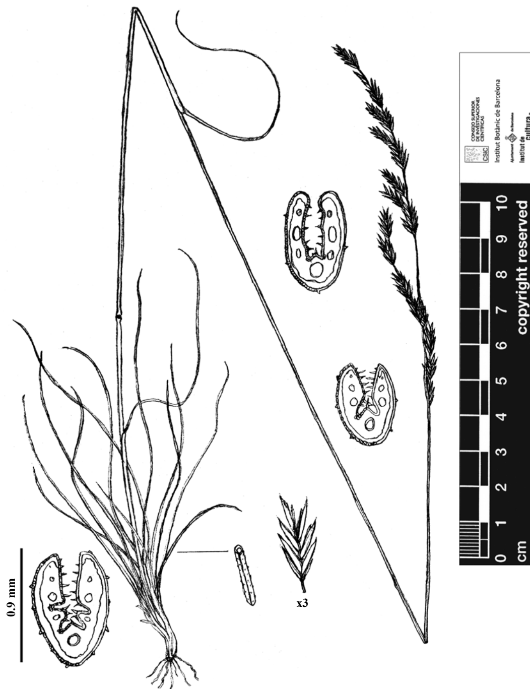
Figure 2. Festuca michaelis . El Castellar. With details of leaf, tiller cross section and spikelet.

up to 1100 m. These plants were formerly placed within F. ovina or F. duriuscula , both sensu lato , and in Pyke (2003a) the populations from the Ebro Valley were referred to as F. gracilior , sensu Fuente & Ortúñez (1998). Another plant with strongly scabrid leaves, F. capillifolia Dufour, distinguished