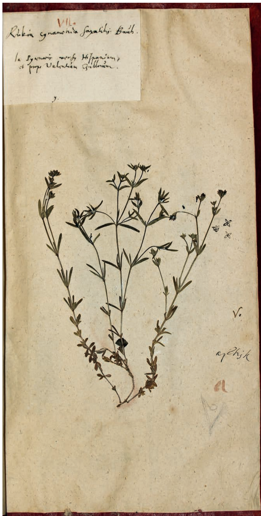
Figure 1. Lectotype (or perhaps holotype) of Asperula pyrenaica L. (UPS, Herb. Burser XIX: 9).